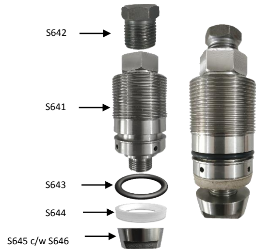
Pic. 6.f. Solid Plug Assy.